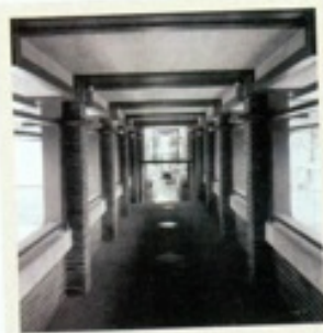
The original 100-foot-long pergola at the Darwin Martin House.

ARCHITECTURE In Buffalo, New York, preservationists are carefully rebuilding the demolished remains of Frank Lloyd Wright's 1905 Darwin Martin House Complex (125 Jewett Pkwy.; 716/856-3858; www.darwinmartinhouse.org; tours $22). Until the project is completed this fall, fans of the influential architect can take hard-hat tours of the Prairie Style house site and learn about the restoration—which included a nine-year search for the perfect golden-yellow Roman bricks.